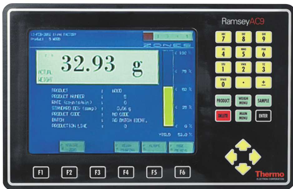
Ramsey AC9 GP Checkweigher